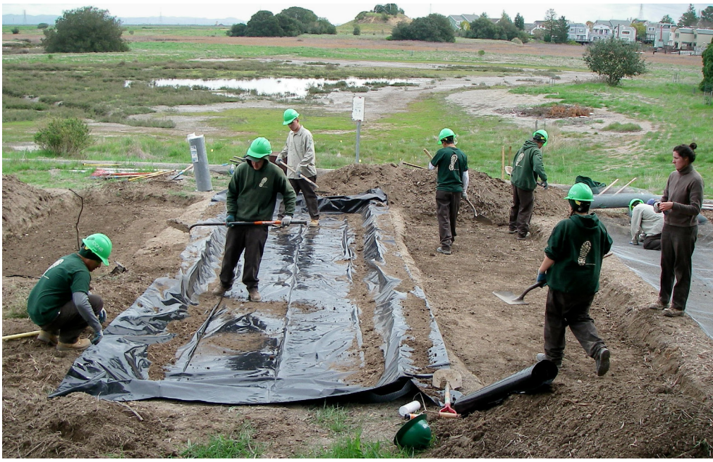
The Conservation Corps North Bay did the heavy work in preparation for replanting the creeping wild rye beds at Bahia