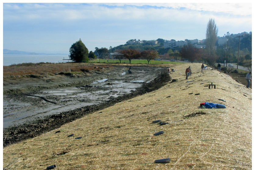
Triangle Marsh in 2004 looking toward the east

Some of the excavated fill and sediment was used to create a berm adjacent to the marsh to provide upland refuge habitat as well as a buffer between Paradise Drive and the marsh. The new berm was planted with native plant species that were recommended and grown by The Watershed Nursery (TWN), a local native plant nursery. TWN staff along with several local volunteers, including students