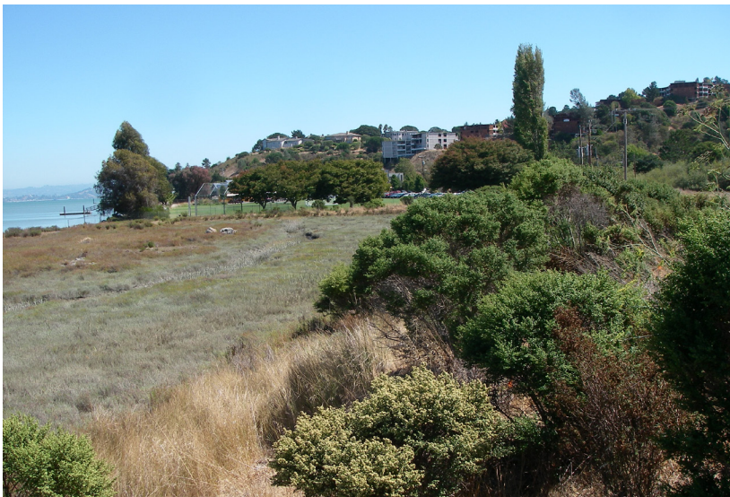
Triangle Marsh in 2012 looking toward the east

The consulting firm, Wetlands and Water Resources, designed the project and the construction contractor was Cooper Crane and Rigging.