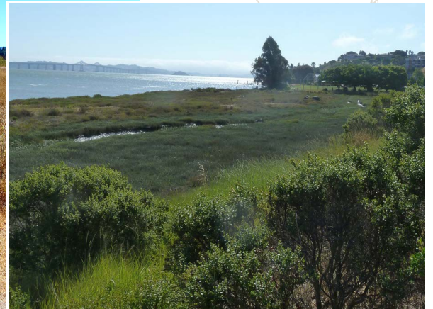
LEFT: Existing conditions of non-native grass invasion at the Corte Madera property RIGHT: What it could become – Triangle Marsh 10 years after restoration

H elp us reach our goal of purchasing this keystone property that is surrounded on the north, south and east by the Corte Madera Ecological Reserve, restoring it to marsh and permanently protecting it as part of the Corte Madera Ecological Reserve.