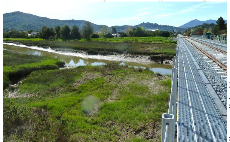
The proposed multi-use path along the SMART tracks would go through and destroy Ridgway's Rail habitat.

SMART is planning to construct the bike/pedestrian path through the Silveira/St. Vincent's seasonal wetlands and Gallinas Creek's tidal marshes that are habitat for the endangered Ridgway's Rail. A path may sound modest, but this path would be 12 feet wide and perhaps wider depending on whether the design calls for it to be on solid fill or pilings. Some sections would be divided into two paths. Letters of opposition are needed to save this important habitat.