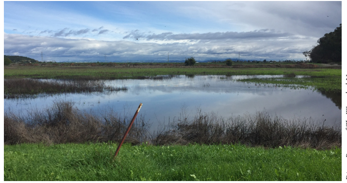
Simmons Slough in Novato finally has substantial ponded water.

We have obtained three cost estimates for repairing our fence along Olive and Atherton Avenues. It is an old farm fence that was on the property when we acquired it 14 years ago. A closer look revealed that actually 530 feet of fencing is missing or damaged; most is along Atherton Avenue, but one section is along Olive. We have applied for a grant from the Marin County Fish and Wildlife Commission to help pay for the repair work. We don't want to leave the fence in a broken down condition. It would send a message that people are free to enter the property and possibly harass