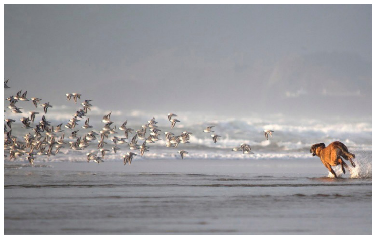
An off-leash dog chasing shorebirds on Ocean Beach

Eagle Trail, Homestead Trail, Homestead Summit Trail, and Homestead Fire Road.