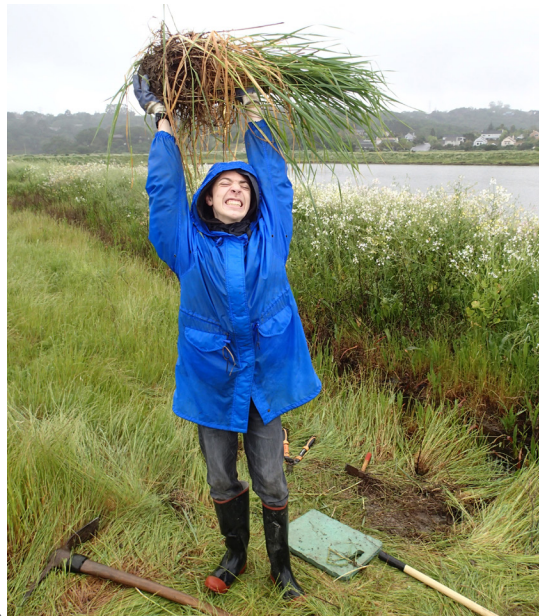
Another clump of Harding grass is uprooted along the Eastern Peninsula at Bahia.