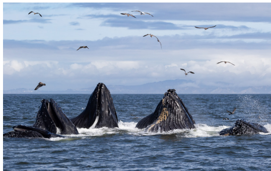
Humpbacks Lunge Feeding

We were thrilled to see several Tufted Puffins near the boat and perched on Sugarloaf, an isolated spire at the islands. These birds are at the southern end of their range. One bird