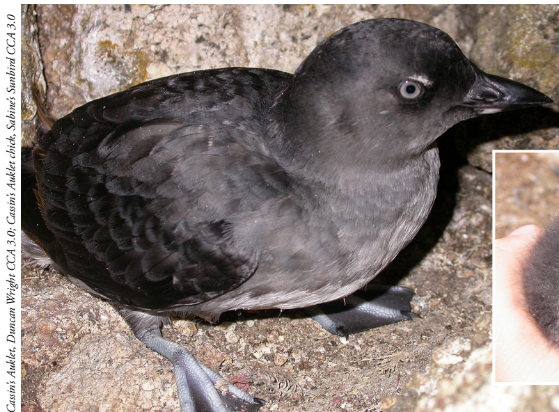
Cassin's Auklet, Cassin's Auklet chick