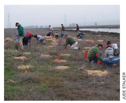
Volunteers hard at work at Bahia

We hold regular workdays the first Saturday of each month during which volunteers remove a variety of invasive weeds.