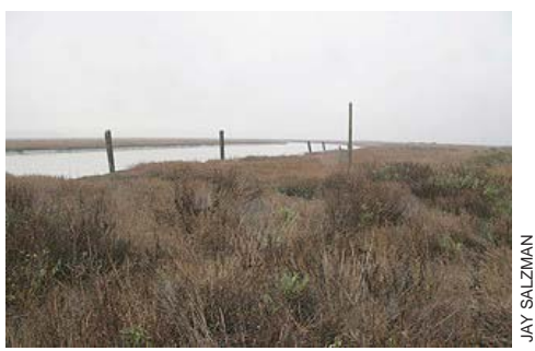
Mira Monte wetlands

We are currently in the due diligence phase of acquiring the Mira Monte property, between the County Airport at Gnoss Field and the Redwood Landfill. To apply for grant monies, an updated appraisal and Phase 1 environmental assessment are required to evaluate this site's potential for possible contaminants. In early February we will get the results, as we are about to begin writing grants for acquisition funds.