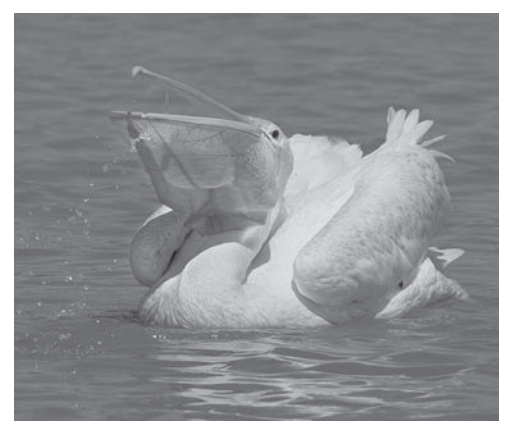
Pelicans at Bahia will be one of the sites to be seen during the Flyway Festival

California parks support extensive wildlife habitat. Currently thousands of acres are closed and risk wildlife and habitat destruction, crime, vandalism and the additional concern of parklands being sold.