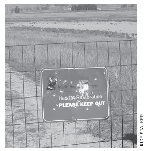
Marin Audubon sign damaged

As we wait for the rain to come so we can begin revegetation, we have spent workdays removing iceplant and other invasives.