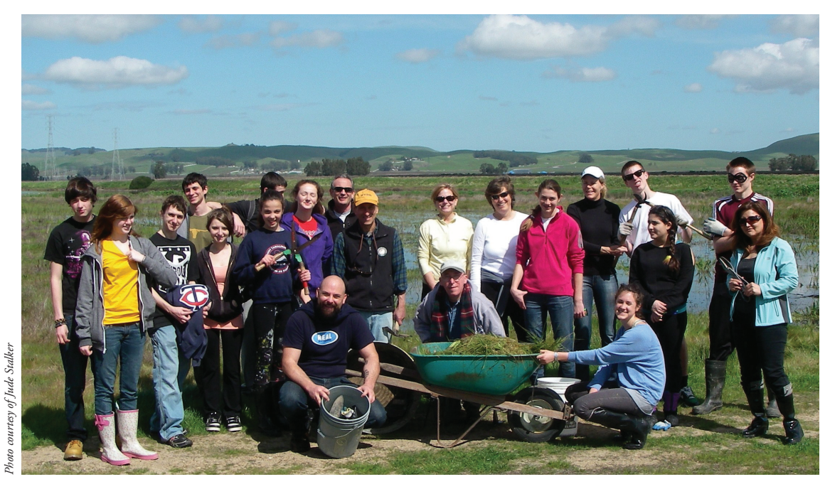
For nearly two years, the Center for Volunteer and Non-profit Leadership has been recruiting volunteers for MAS's monthly work days at Bahia. This is one of those groups.