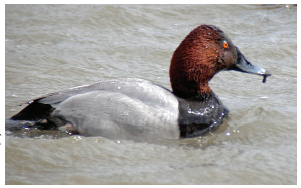
Canvasback X Redhead