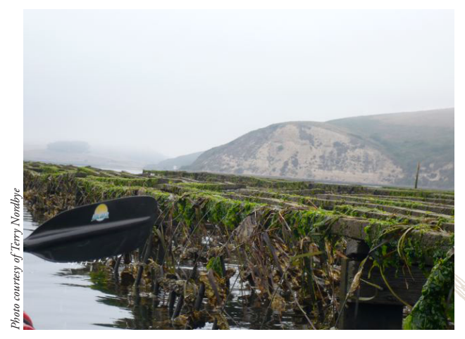
Oyster racks exposed at low tide

he National Park Service (NPS) has prepared a Draft Environmental Impact Statement (EIS) for a new Drakes Bay Oyster Company (DBOC) Special Use Permit (SUP). The Draft EIS is now available for public review and comment at this web link: parkplanning.nps.gov/document.cfm?parkID=333&projectID=33043&documentID=43390