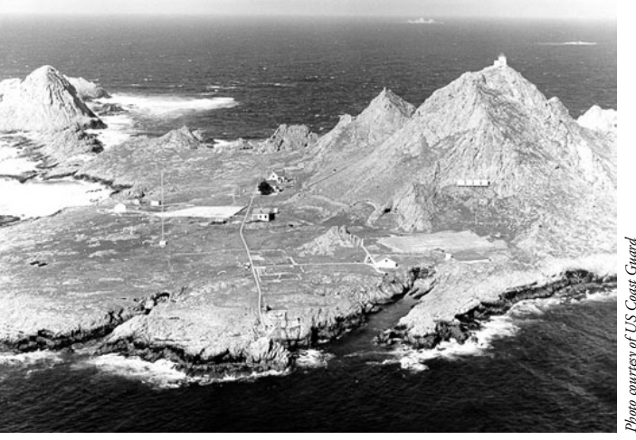
Southeast Farallon Island

Tested hazing methods would be used to scare away Western Gulls, the species most at risk. Methods would include lasers, spotlights, air cannons, and predator calls. Seabirds are not