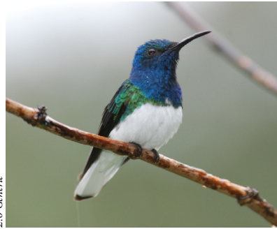
The Lilac Koller, Creative Commons Attribution 2.0 Generic