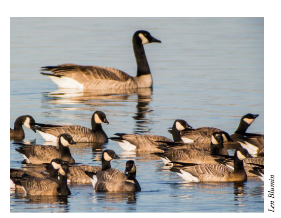
Cackling Geese and one Canada Goose

With the arrival of March, so do arrive a handful of "First of Season" migrants. Coming from southern wintering grounds, these songbirds are the first to take advantage of all that spring has to offer. Longer days, tender foliage, the onset of blooming and the appearance of insects set the stage for the peak of the breeding season. Meanwhile winter residents here are also taking their cues from the landscape. As the days get warmer and the land gets drier those oh so common sparrows and kinglets will become only memories in just one month from now. With the best part of the wildflower season also upon us,