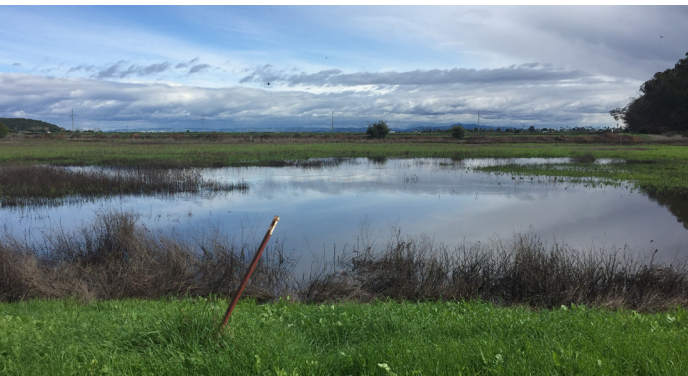
Simmons Slough in Novato finally has substantial ponded water.

We have obtained three cost estimates for repairing our fence along Olive and Atherton Avenues. It is an old farm fence that was on the property when we acquired it 14 years ago. A closer look revealed that actually 530 feet of fencing is missing or damaged; most is along Atherton Avenue, but one section is along Olive. We have applied for a grant from the Marin County Fish and Wildlife Commission to help pay for the repair work. We don't want to leave the fence in a broken down condition. It would send a message that people are free to enter the property and possibly harass