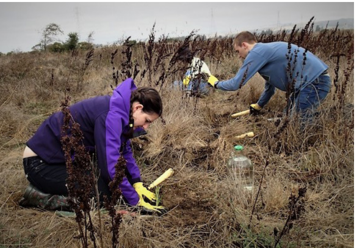
Student volunteers from Dominican University's Environmental Science class started the planting season at Bahia by transplanting creeping wildrye.

Sign up by December 26 by completing the registration form at www.marinaudubon. org/cbc_form.php or contact compilers Ed