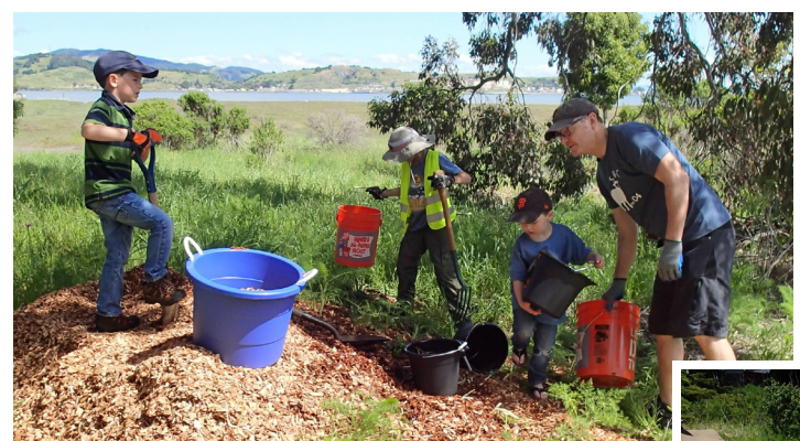
Marin Cub Scouts covered an area of invasive nonnative plants with cardboard, fastened it in place with "staples," and covered it with wood chip mulch to prevent anything from seeing the light and growing. Next winter they would like to help plant native plants in the same area.