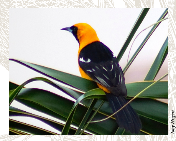
A male Hooded Oriole in a fan palm

As we descended, the broken song of a Bullock's Oriole attracted our attention and