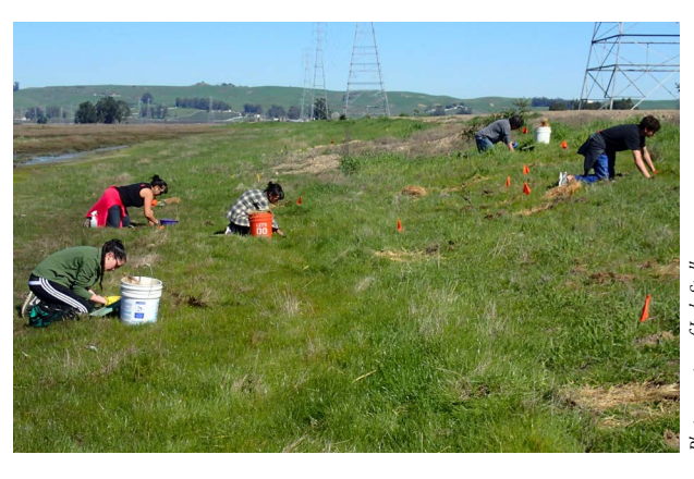
Volunteers on Valentine's Day planted creeping wild rye upslope from the adjacent tidal marsh on the western peninsula at Bahia.

We hope these plants will spread out and join the past plantings to eventually cover the levee slope and provide native upland habitat for the wildlife at Bahia.