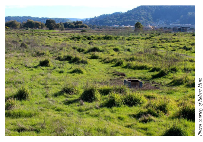
Now dominated by non-native grasses and fennel, the property for acquisition will be restored to tidal marsh and an upland with native plants before becoming part of the Corte Madera Ecological Reserve.

After 25 years of trying, we can't lose the opportunity to permanently protect and restore this crucial property. The endangered Ridgway's Rails, and other species that depend on this habitat, need to have the property protected and restored.