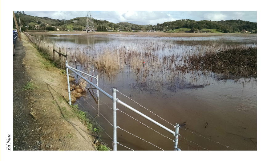
MAS's Simmons Slough property is now flooded as expected during winter