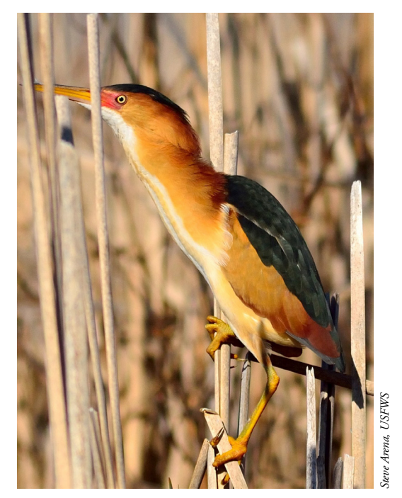
Least Bittern, male

A much rarer warbler and one of the best birds of the month was a Black-and-white Warbler found at Five Brooks on the 17th (KS). This is likely a locally-wintering bird, as our eastern migrants generally don't arrive until much later in the spring, with March being perhaps the least-