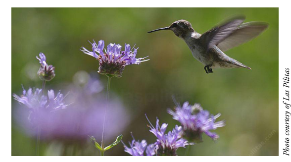
A Hummingbird on Musk Sage (Salvia clevelandii)

Musk Sage is hardy to below 10°F, survives in soils that contain a predominance of clay or